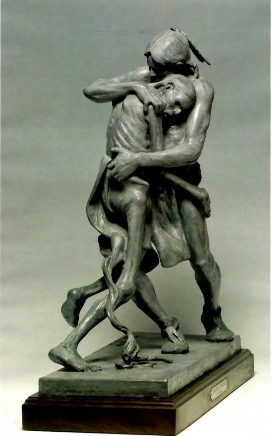
The Ghost Wrestler